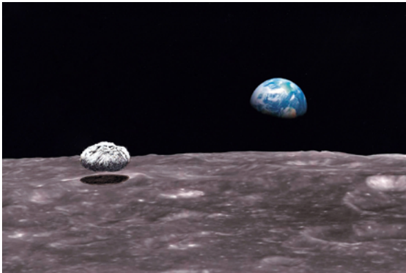
Keiji Uematsu Floating stone - Earthrise , 2020 Drawing on inkjet print, 21 x 29,7 cm, Unique piece © Keiji Uematsu courtesy baudoin lebon