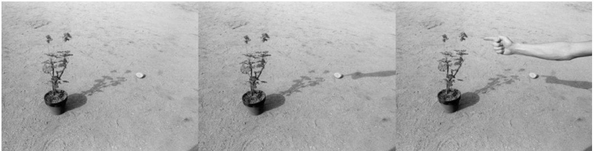
Keiji Uematsu Seeing II - Flower , 1975 series of 3 photographs, silver print Each image: 40 x 50 cm, frame: 41 x 51 cm Edition N° 2/4