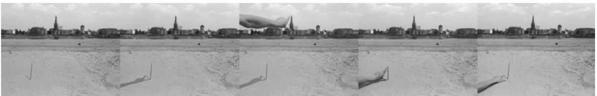
Keiji Uematsu Measuring - Landscape I , 1976 series of 5 photographs, silver print Each image: 40 x 50,5 cm, frame: 42.5 x 53 cm Edition N° 3/4 © Keiji Uematsu courtesy baudoin lebon