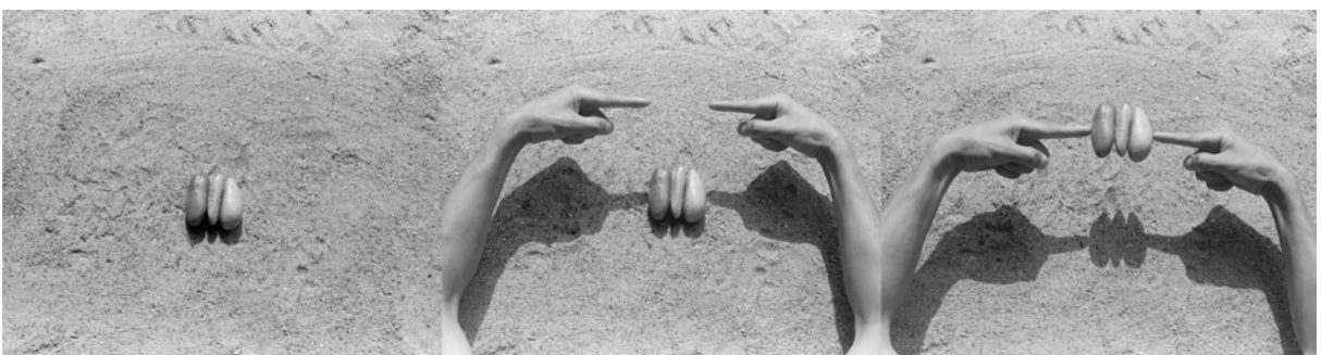
Keiji Uematsu Interval - Three Stones , 1976 series of 3 photographs, silver print Each image: 39.2 x 49.2 cm, frame: 40 x 50 cm Edition N° 4/4 © Keiji Uematsu courtesy baudoin lebon