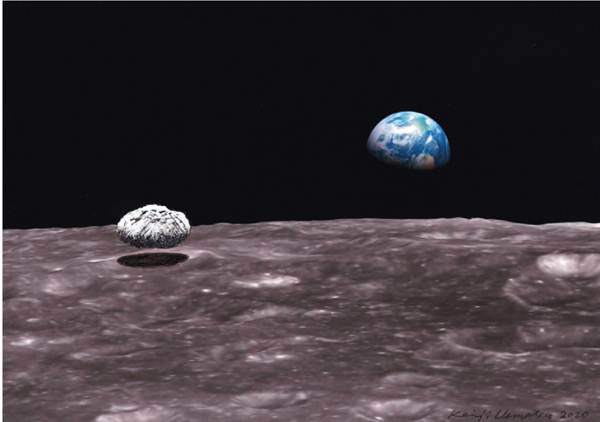
Floating stone - Earthrise, 2020, Drawing on inkjet printing, 21 x 29,7 cm © Keiji Uematsu

/// opening wednesday April 12th from 6pm to 9pm