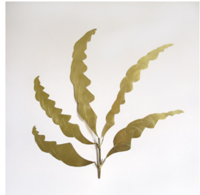
Keiji Uematsu Touch of spiral branch , 2014 Brass, 115 x 116 x 6.8 cm, Unique piece © Keiji Uematsu courtesy baudoin lebon