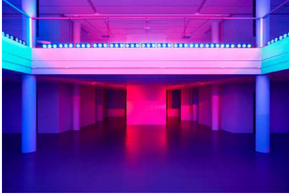
Nathalie Junod Ponsard, Thickness of light , 2013. Installation at the EDF Foundation, exhibition from 5 October to 10 November 2013.