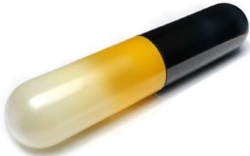
Nathalie Junod Ponsard, Substance , 2022, enamelled glass sculpture © courtesy of the artist and baudoïn lebon