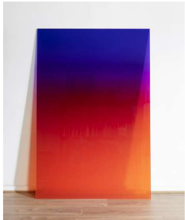
Nathalie Junod Ponsard, Dédoublement , 2019, glass, ink, Led projectors and programming, 260 x 150 x 40 cm. Commissioned by the Centre national des arts plastiques CNAP, France.