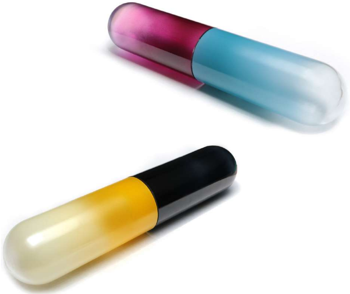
Nathalie Junod Ponsard, Substance , 2022, enamelled glass sculptures