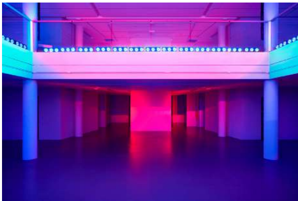
Nathalie Junod Ponsard, Thickness of Light , 2013. Installation at the EDF Foundation, exhibition from 5 October to 10 November 2013 © courtesy of the artist and baudoïn lebon.