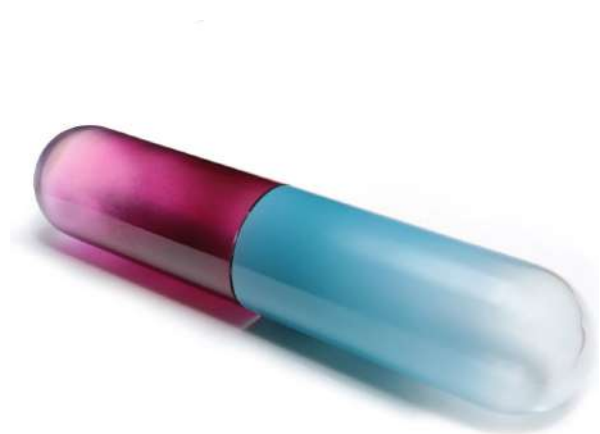
Nathalie Junod Ponsard, Substance , 2022, enamelled glass sculpture © courtesy de l'artiste et baudoïn lebon.