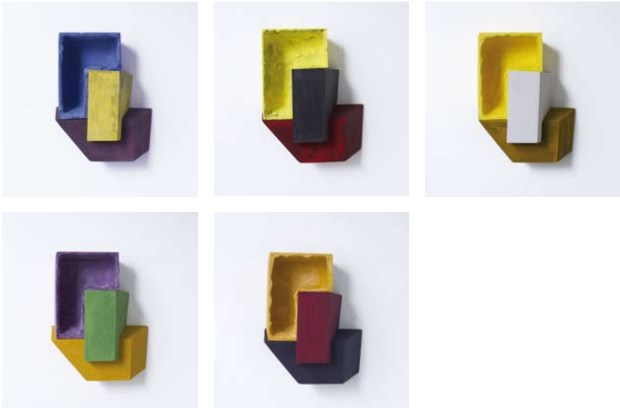
Chevauché, glissé, plâtre, pigments fixés, 2013