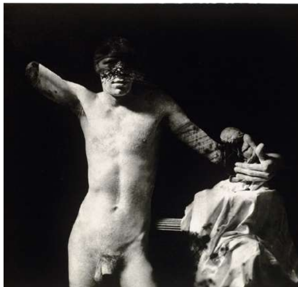
Joel-Peter Witkin Hermes, San Francisco , 1981 Silver Print Image: 37 x 37 cm, Frame: 66 x 56 cm