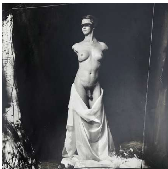
Joel-Peter Witkin Madame X, San Francisco , 1981 Silver Print Image: 37 x 37 cm, Frame: 63 x 63 cm