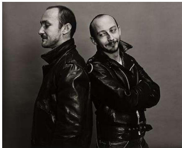
Bettina Rheims François et Hugues III , 1981 Silver print on baryta paper Image: 44 x 55 cm, Edition N° : 14/15