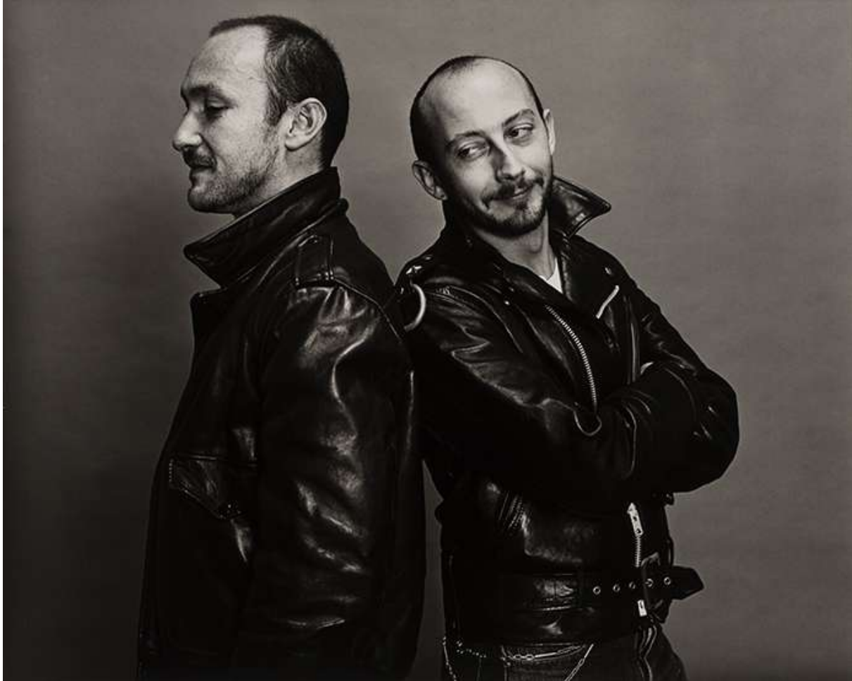
Bettina Rheims, François et Hugues III, novembre 1981, Paris © with the kind permission of Bettina Rheims

/// opening wednesday, january 31 ST , from 6 to 9 p.m.