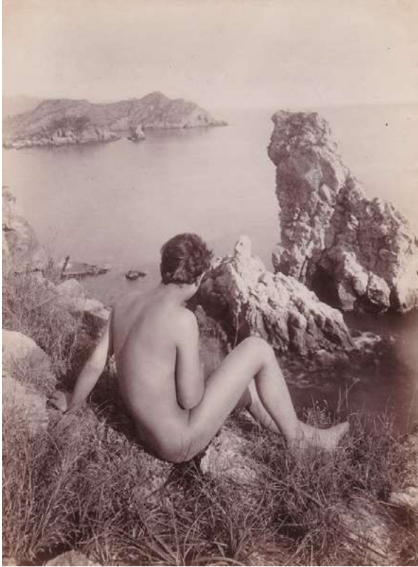
Wilhelm von Gloeden Jeune homme vue sur mer , 1905 Vintage silver print Image: 22 x 17 cm © Wilhelm von Gloeden courtesy baudoin lebon