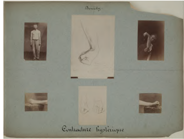
Albert Londe Bourdy - contracture hystérique, c. 1883 Photographic Iconography of the Salpêtrière Set of 47 plates Silver print pasted on cardboard Frame: 35 x 46,5 cm