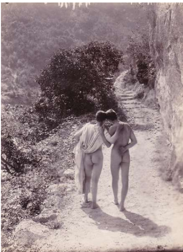
Guglielmo Plüschow Deux garçons qui marchent , circa 1900 Vintage silver print Image: 22,3 x 16,8 cm © Guglielmo Plüschow courtesy baudoin lebon